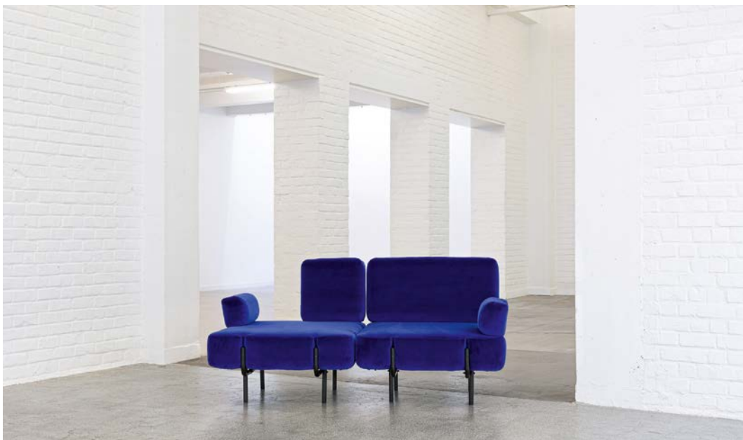
→ ADAPTABLE SOFA , 2019 BLACK GALVANIZED STEEL, BLUE COTTON © ELINE WILLAERT