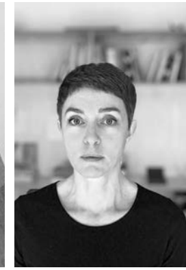
LUCILE DESIGN STUDIO