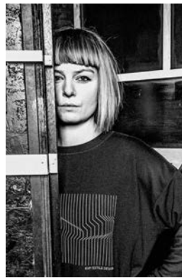
KVP - TEXTILE DESIGN