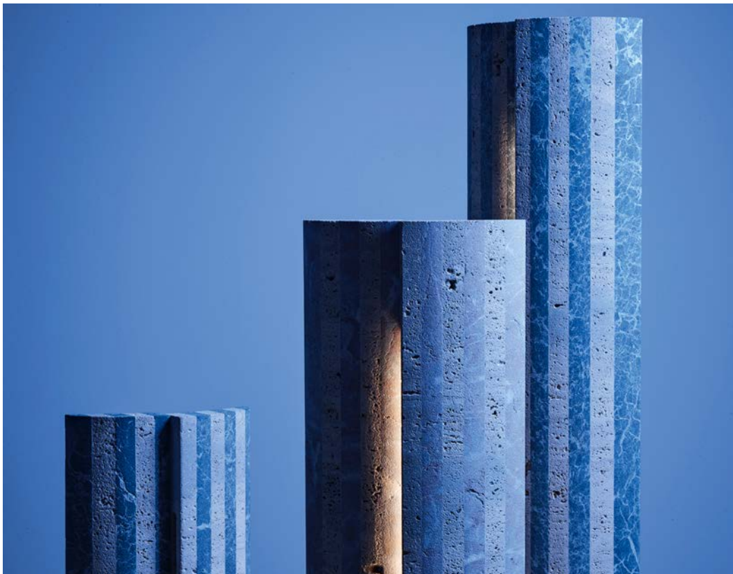
← MOONLIGHT, LAMP, 2020 TRAVERTINE AND MARBLE WASTE