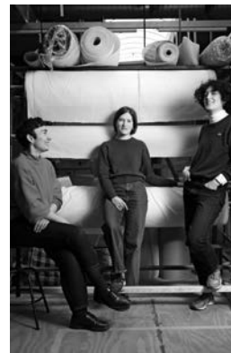
MAAK & TRANSMETTRE