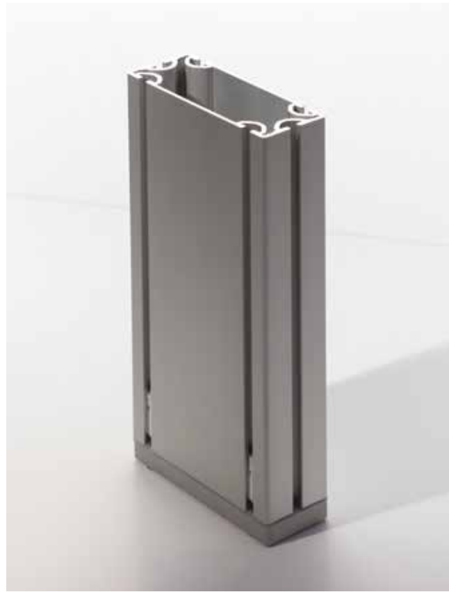
27 SABO AtMa inc.

'SABO' means erosion control and is fundamental in the fight against mudslides and landslides caused by rain and earthquakes in Japan. This series by design studio AtMa inc. explores the relationship between nature and man-made objects through a pair of planters, a series of flower vases and a sundial (pictured).