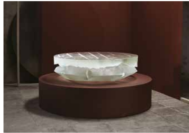
43 ALTAR OF IMAGINATION Kiki Van Eijk

This new piece created for Rademakers Gallery for Design Miami/Basel celebrates the flexibility, resilience and adaptability of humanity. These textile collages are truly experimental, combining wool, cotton, felt, linen and leather and introducing tufting for the first time. The aim was to be as faithful as possible to Van Eijk's original sketches.