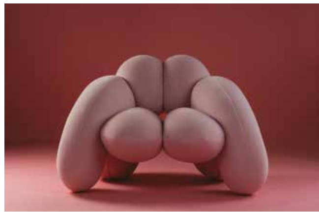
41 DOMESTICITY AT LARGE Objects of Common Interest

Presented at Alcova during Milan Design Week, Objects of Common Interest showed an installation entitled Domesticity at Large that featured a series of objects (chair, table, stool, light, mirror) conceived as acts-of-living: familiar set ups of domestic life within a futuristic scenographic environment of textural and formal ambiguity.