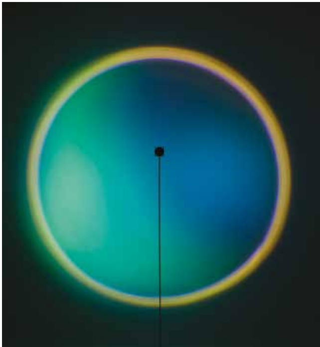
32 COSMO COLLECTION