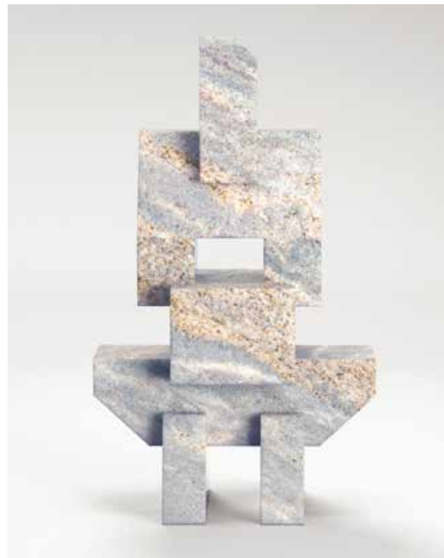
35 COMMON PARTS GROUP