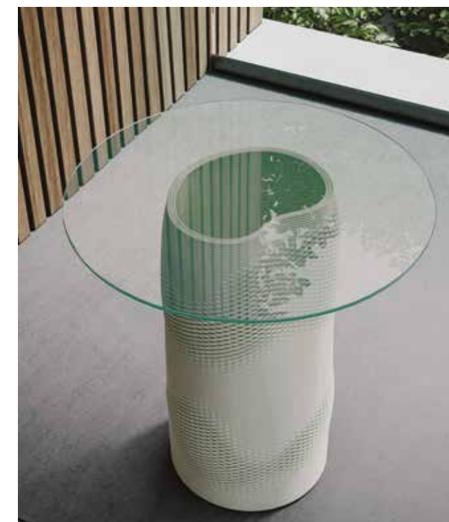
37 LANDSCAPES COLLECTION