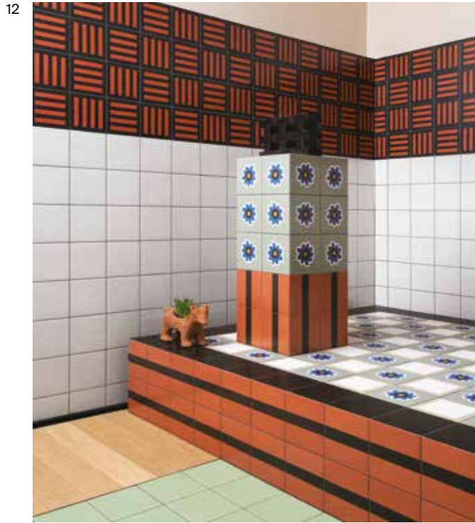
11 UGRESS (WEEDS) Studio Malm

'Ugress' is a furniture series by Mathias Malm that explores an imposing and expressionist approach to modern furniture design. By utilizing algorithmic technology, the furniture grows its own shapes digitally and pays tribute to the mathematical representation of nature in art and ornamentation.